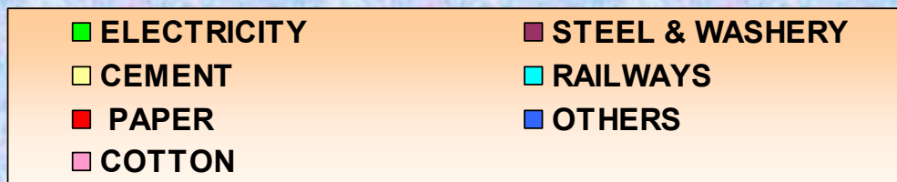
Exhibit (Table 2.4)